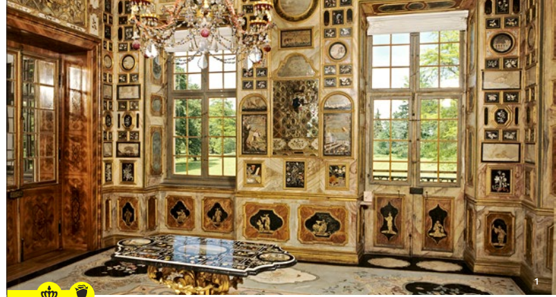
Precious even to the smallest detail: The Florentine cabinet is a stunning sight

No expense was spared on the palace interiors, which are replete with all forms of 18th century craftsmanship: Floors of stucco marble, or scagliola, walls of glazed earthenware tile, richly decorated stuccoed and frescoed ceilings, majestic wall hangings with the most delicate embroidery, and exquisite furniture show both Sibylla Augusta's exquisite taste and serve as self-representation for the art-loving princess. In particular, the Florentine cabinet , completely original and singular in Europe, overwhelms visitors with the perfection of its craftsmanship: 758 extravagantly worked illustration panels made of semi-precious stones and other materials adorn these walls with lush brilliance.