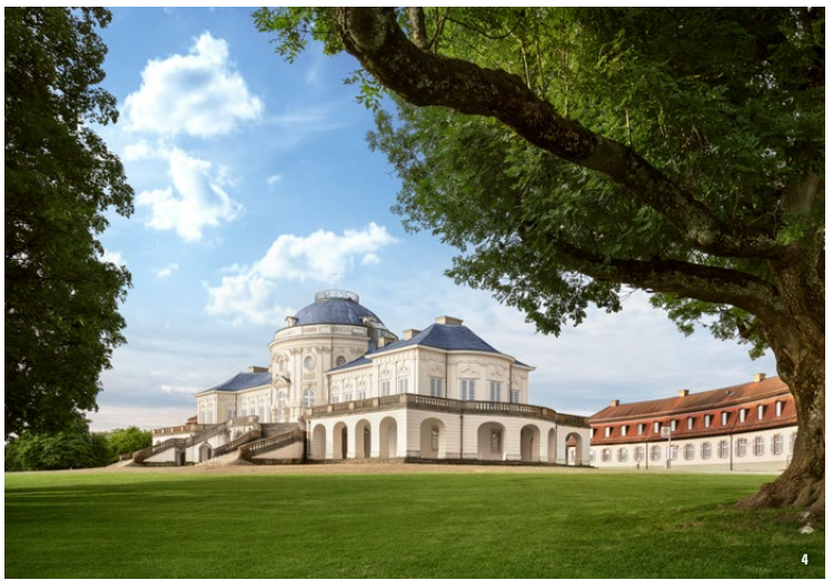
in an idyllic setting, Solitude offers exciting perspectives