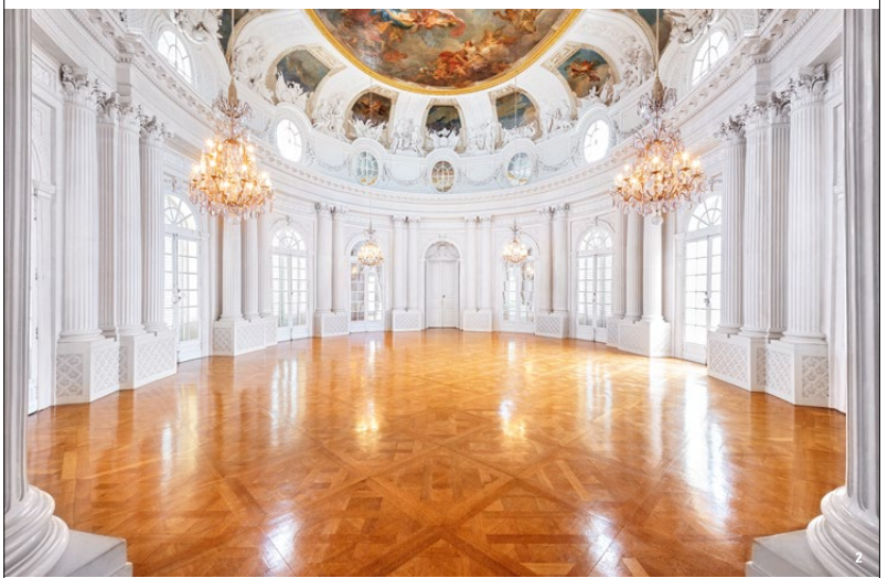
<u>*</u> The rooms in the Solitude Palace are some of the most beautiful interior spaces created in the Duchy of Württemberg in the 18th century