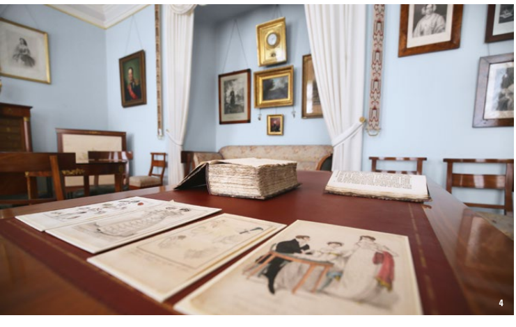
<u>the Duchess's taste and personality are strikingly evident in the classically furnished living room</u>

Duchess Henriette, spent another 40 years at Kirchheim until her death in 1857. Part of the well-preserved private residence is now a palace museum, which offers fascinating insights into the lifestyle of 19th-century nobility.