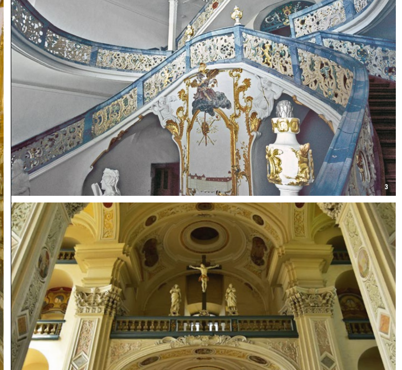
Sweeping: The Rococo staircase in the abbey seems to dance Anything but modest: the Baroque church

▲ The Baroque order hall and its display of garb worn by the various orders is especially impressive