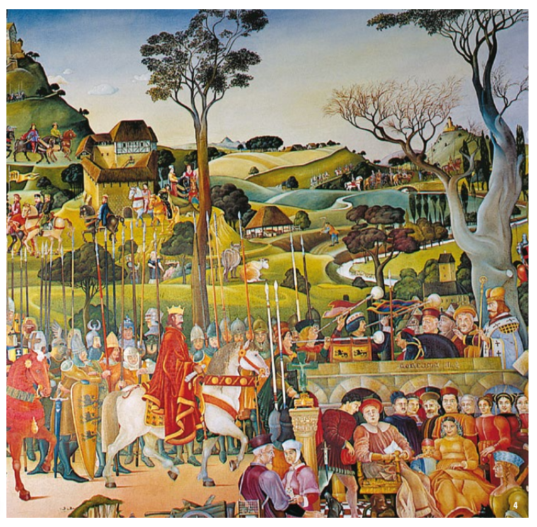
The Staufer mural, a panoramic painting that depicts the rise and fall of the Staufen dynasty, was completed in 2002 and is located

erected the Staufen Tomb as a show grave for the revered founder's family. In 1475, the then-abbot had all Staufer graves exhumed and the remains moved to the magnificent tomb in the central nave.