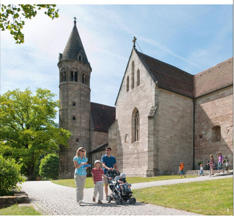
factorial The monastery grounds are the perfect place for guests to take a stroll; the complex can even accommodate strollers