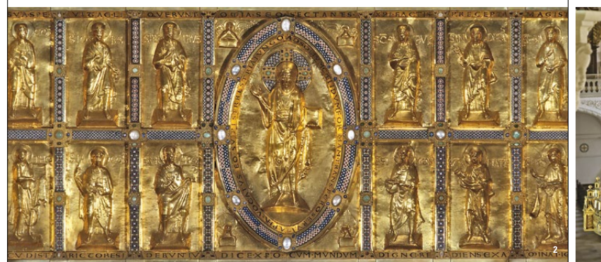
Dating back 900 years, this altar frontal is a unique witness to the Middle Ages