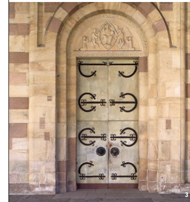
🏰 Right: The main door of the monastery church features the original Romanesque metalwork