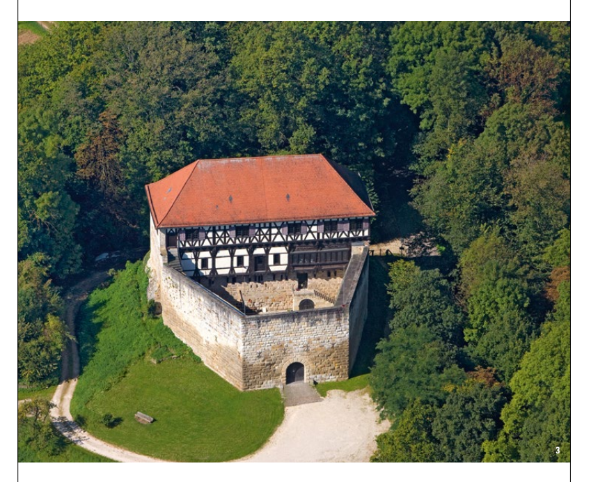
*10-meter-high walls surround the fortress, which served as an outlying estate for the region below their ancestral seat on Hohenstaufen