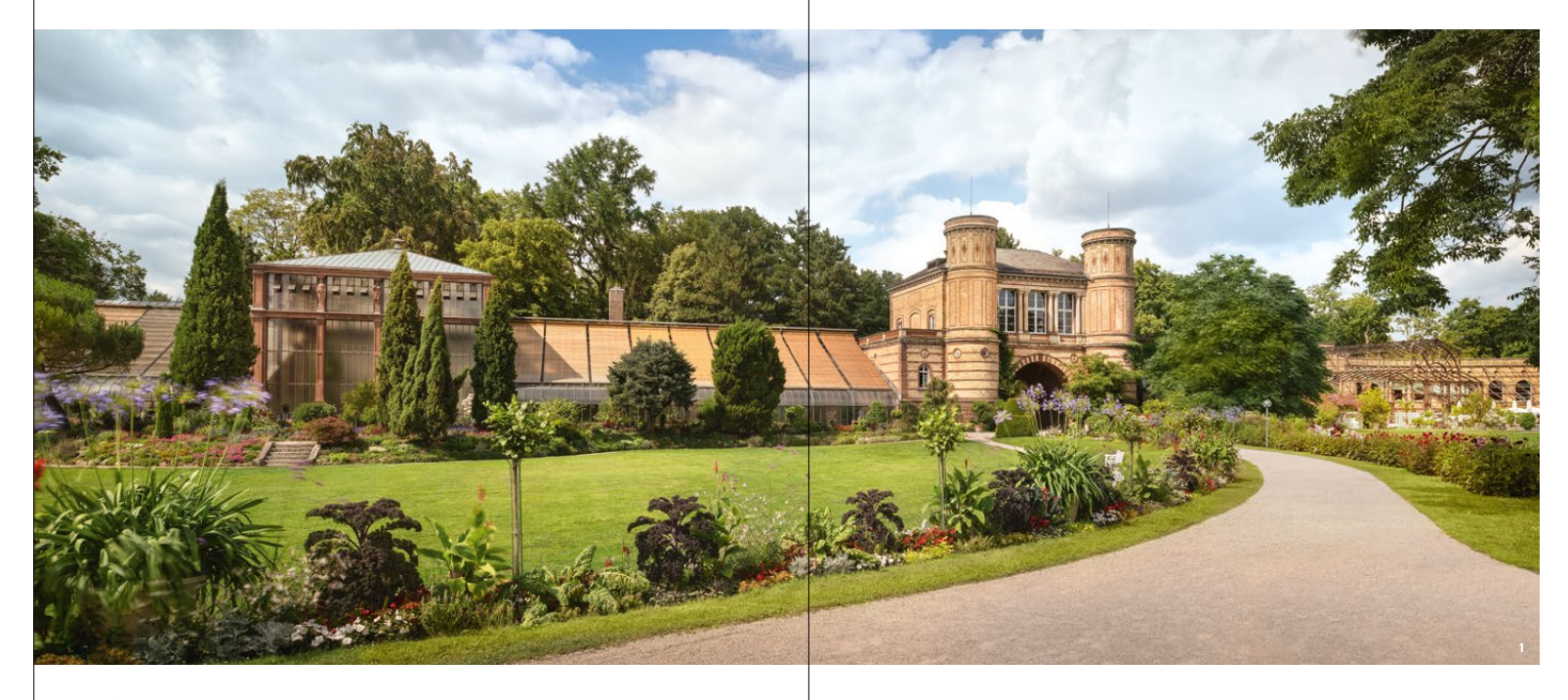
The historic buildings and the exceptional collection of plants make the Botanical Gardens a rewarding place to visit

The newly opened greenhouses offer guests a wide array of stunning plants and greenery