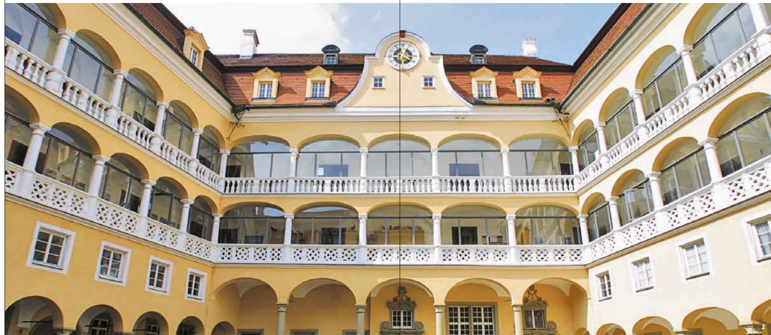
👑 Graceful and harmonious: the Renaissance courtyard possesses singular beauty

After a fire the following century, the palace was renovated in the Baroque style. In addition to lavishly redecorated interiors, the new features included a double staircase, completed in 1726, a mansard roof on the main building, and a majestic Throne Room.