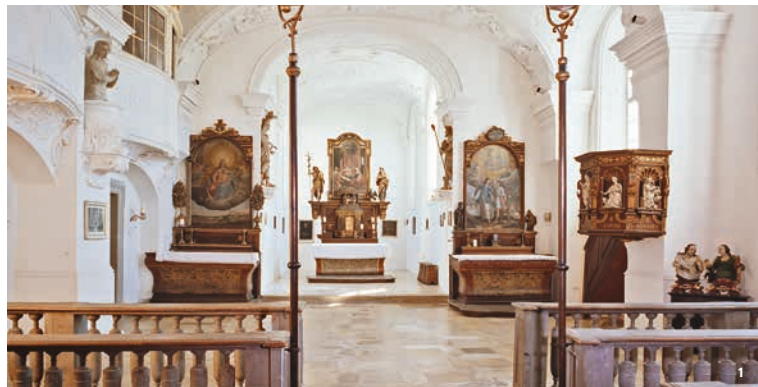
👑 The palace chapel and its 17th century interior

Between 1603 and 1608, the palace was remodelled in the Renaissance style, on the orders of Prince-Provost Johann Christoph I von Westerstetten. This design—a four-sided structure built on a trapezium-shaped floorplan, with towers in all four corners—still defines the appearance of the complex today. The Arkadenhof , a courtyard bounded by three stories of elegant arcaded balconies, is a remarkable architectural achievement.