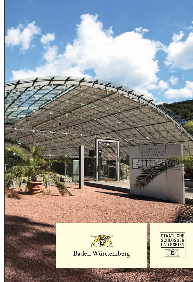
IMAGE CREDIT: SSG/LMZ: cover photo, 1, 3, 4, 5 Achim Mendel; 2 RFP Freiburg Ref. Denkmalpflege // Design concept: www.jungkommunikation.de