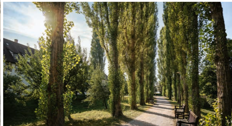
👑 🏰 A towering avenue of poplars runs between palace and park

To this day, the importance and power of the Teutonic Order in the Christian realm can still be seen in the rooms of the palace. The lives and work of a religious order is not the only aspect on display in this 3,000 m 2 space. The museum showcases the town's history and features the Adelsheim's antiquities collection, the dollhouse collection, the Mörike cabinet, an exhibition on the Neolithic Age in the Tauber Valley with a touching family burial plot, and an array of temporary exhibits. Always worth a visit!