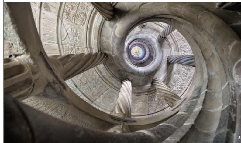
👑 🏰 Climbing the Berwart spiral staircase offers unique perspectives