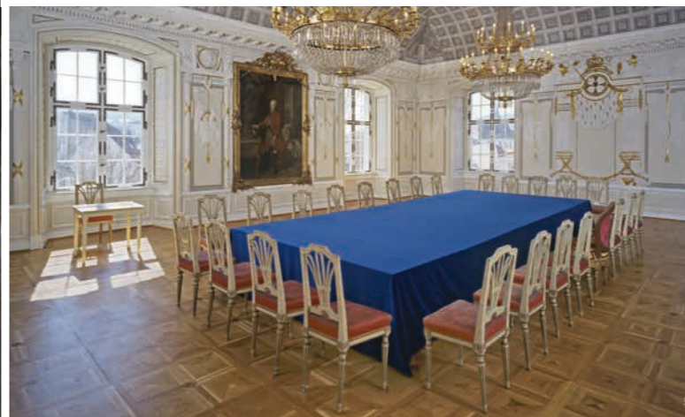
👑 🏰 Site of important decisions: The last General Chapters of the Mergentheim era were held in the chapter house

on the edifice. The last major construction work of the Teutonic Order took place between 1780 and 1782, with the erection of the elegant Classical chapter house designed by Franz Anton Bagnato.