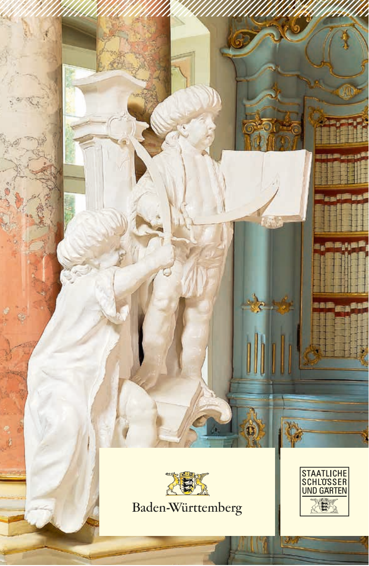
Design concept: www.lingcommunication.de

A CAPTIVATING CULTURAL SITE WITH HEAVENLY BAROQUE STYLE