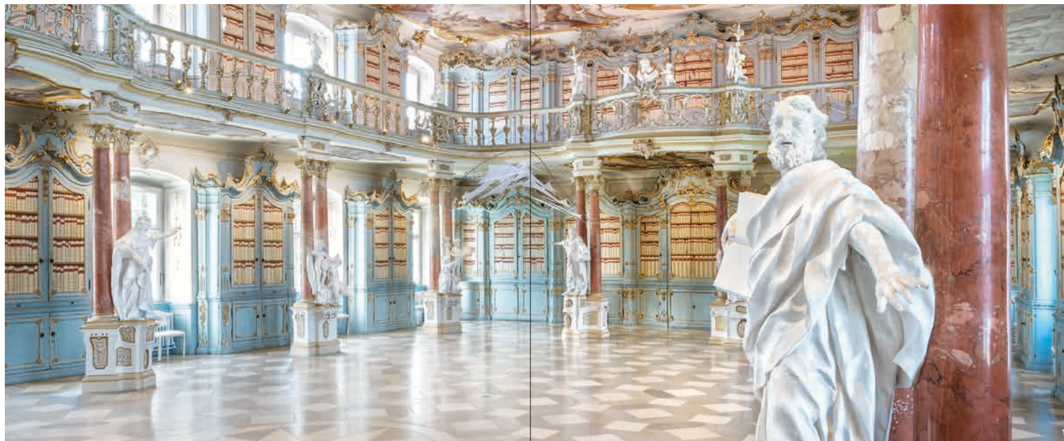
🏛 A heady mix of shapes and colors: The library at Schussenried Monastery is a Rococo masterpiece

A recently developed interactive museum sheds light on the history of the monastery, the role of science and the religious way of life. A permanent exhibition and a rich program of temporary exhibits make Schussenried Monastery an important element of the region's cultural scene. In short, every visit is a truly uplifting experience.