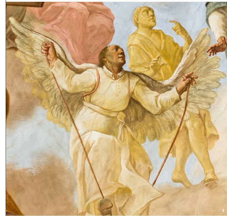
🏛 Schussenried's most famous son: Father Caspar Mohr, depicted in the library ceiling fresco; he was nearly a pioneer of aviation

The best-known image from the fresco shows the enterprising father, Caspar Mohr. In the 17th century, he constructed a feathered flying machine, almost becoming the aviation pioneer of Upper Swabia, generations before the Zeppelin airship was invented.