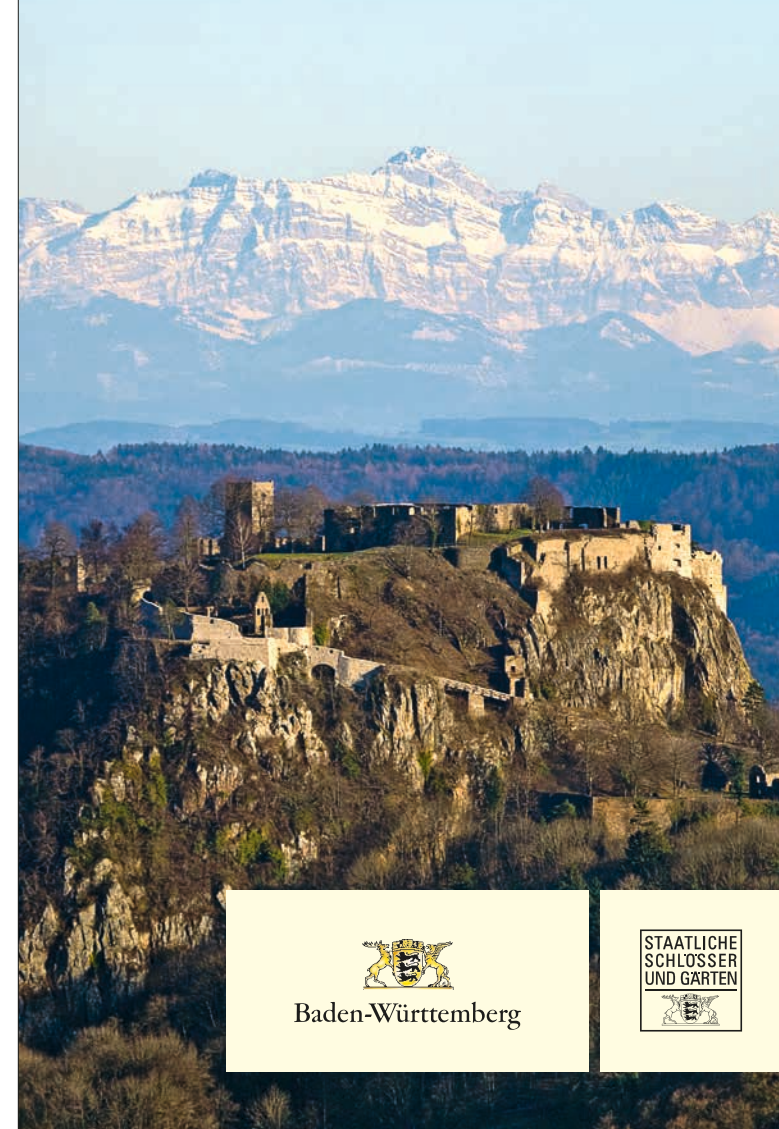
Design concept: www.jungkommunikation.de