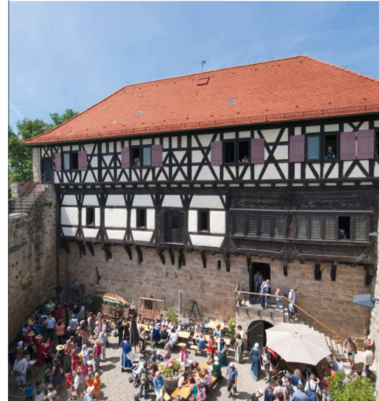
🏰 The medieval courtyard facade is perfect for events

Wäscherschloss Castle sits in the heart of the historic Staufer countryside. In addition to the numerous of Staufer structures, the beautiful landscape and three Kaiserberg mountains —Hohenstaufen, Rechberg and Stuifen—invite visitors to a deeper exploration of the region. A visit to Wäscherschloss Castle can be extended by a detour to Lorch Monastery and its significant Staufer burial place, or up the Hohenstaufen hill.