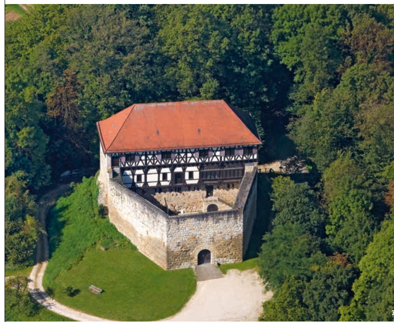
🏰 10-meter-high walls surround the fortress, which served as an outlying estate for the region below their ancestral seat on Hohenstaufen