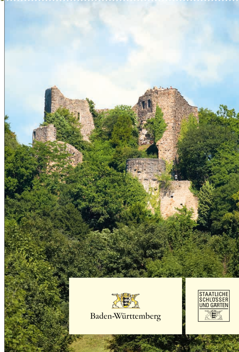
IMAGE CREDIT: SSG/LMZ; cover photo: 2, 4 Achim Mende; 1 Author unknown; 3 Nils Schubert // Design concept: www.lungkommunikation.de