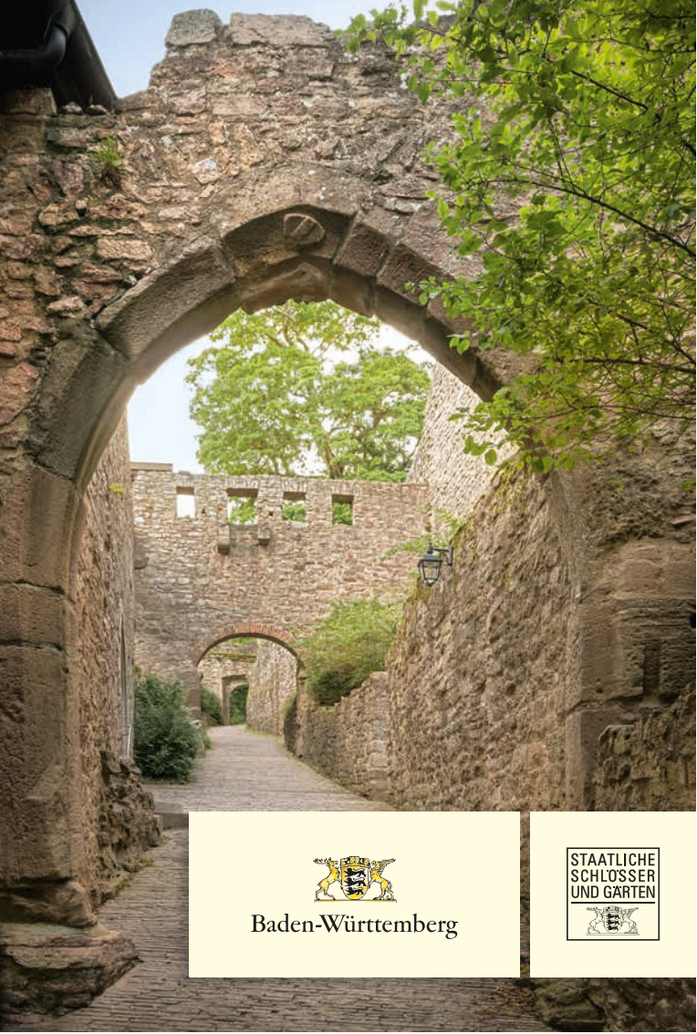
Design concept: www.jungkommunikation.de

SPECTACULAR ANCESTRAL SEAT OF THE MARGRAVES OF BADEN